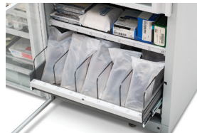
XT Pull-Out Shelf