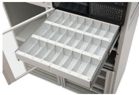
XT Supply Drawer