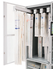
XT Supply Rack